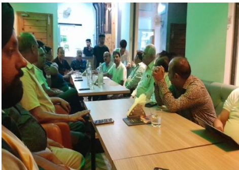
MINUTES OF GENERAL HOUSE MEETING ON 18th JULY 2025