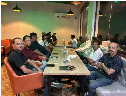
Minutes of meeting on 11th July 2025